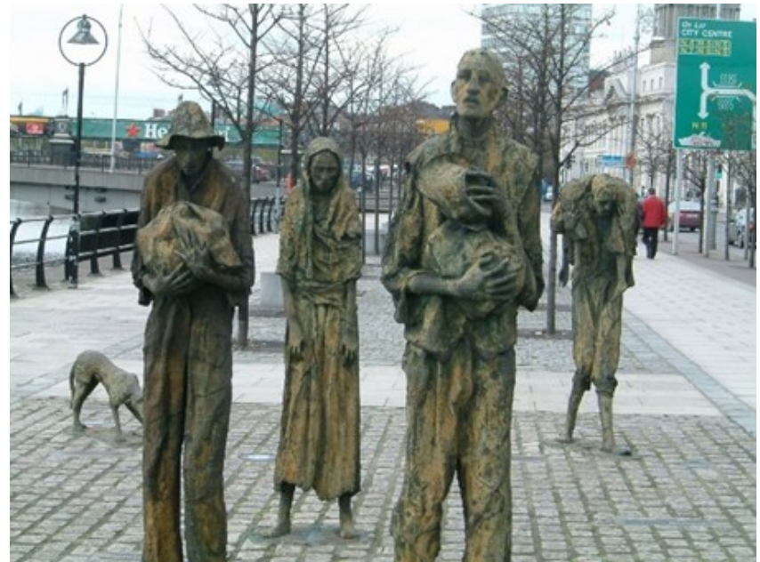
Rowan Gillespie's sculptures in Dublin depicting migrants in the Great Potato Famine from 1845 to 1852.