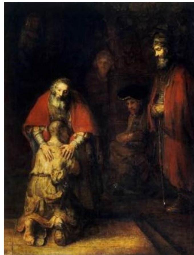
~Rembrandt, The Return of the Prodigal