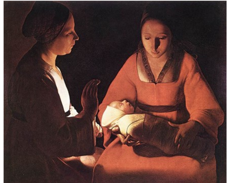
"Newborn". Georges La Tour (1593-1652)