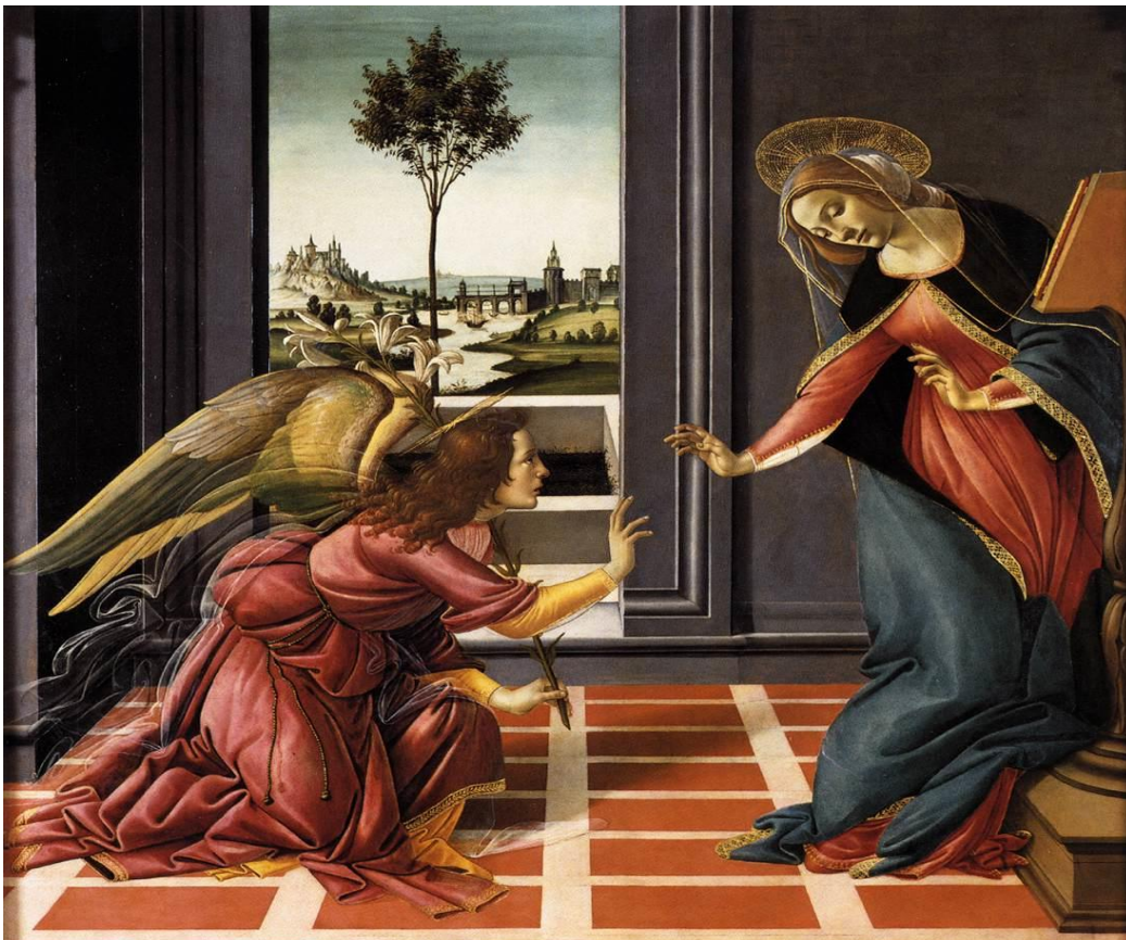
Botticelli: The Annunciation (1481)